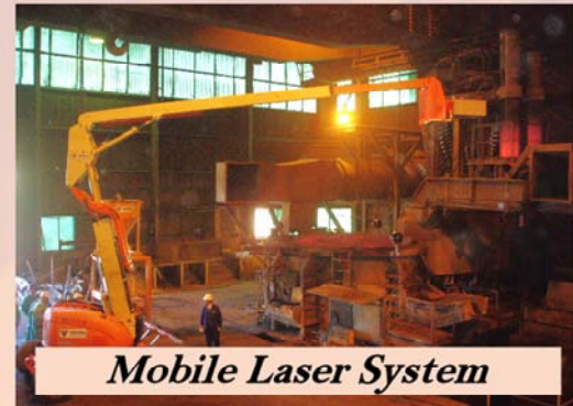
Mobile Laser System

Mobile EAF and Ladle Lasers & Mobile ALuminum Furnace Lasers